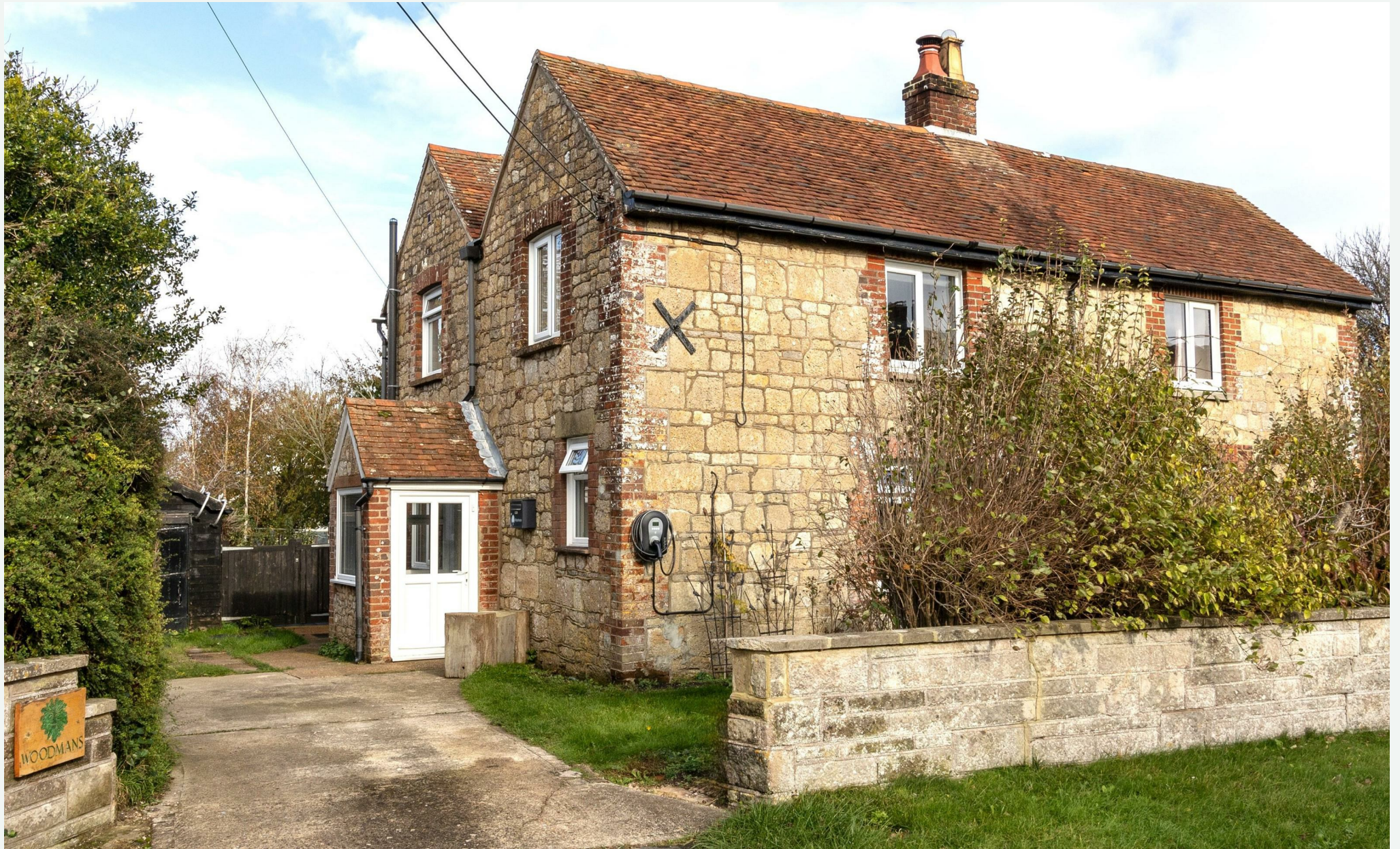
Woodmans, Thorley, Isle of Wight, PO41 0SS